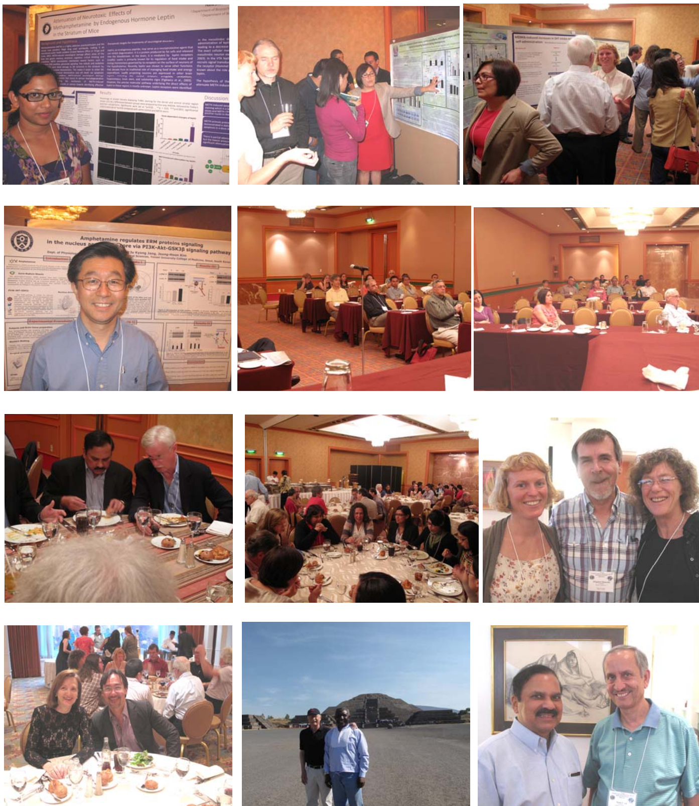
Pictures above shows various activities during IDARS meeting in Mexico-city in 2013 from outstanding poster and slide presentations , social functions, site seeing and visit to the museum and pyramid by some members. Overall IDARS meetings continue to be spectacular.