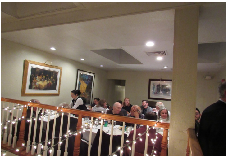
Members of IDARS, and their guests during the SFN meeting in Washington DC in 2017.